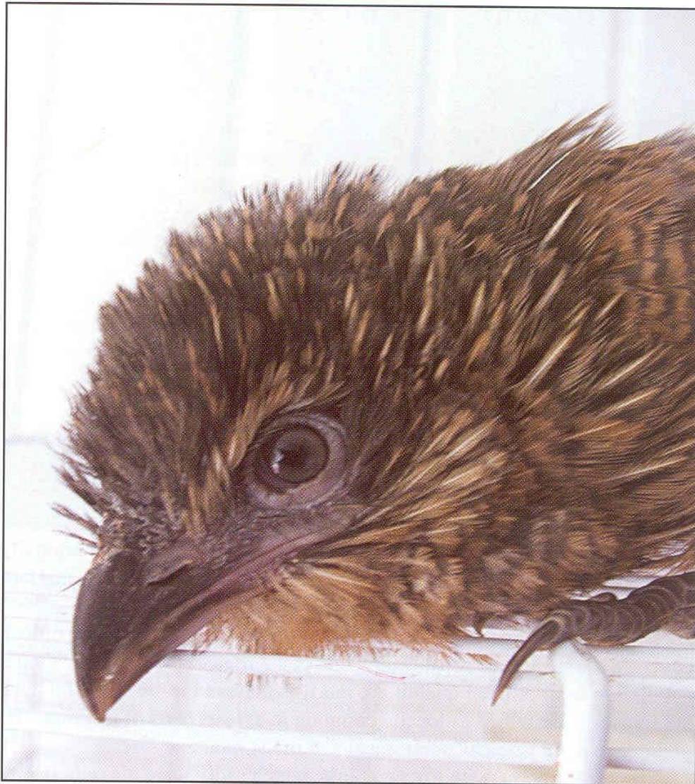
Fifty days old.